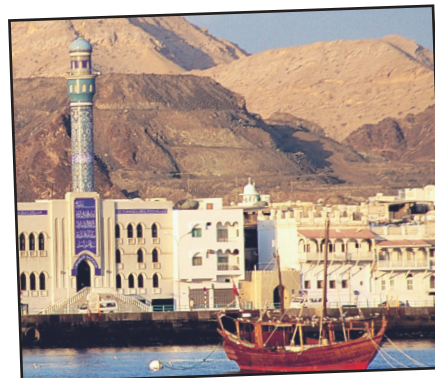
Must-see: the traditional sea town, Muttrah