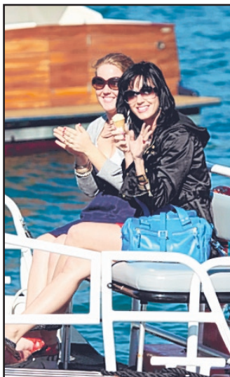
Sun-kissed: Katy Perry — with a girl, of course — likes it in Sydney